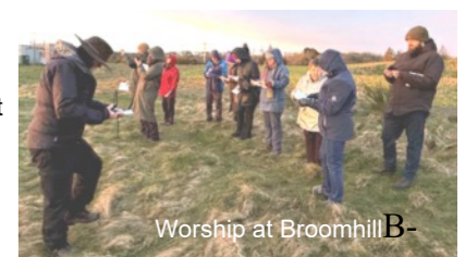
Worship at Broomhill B-